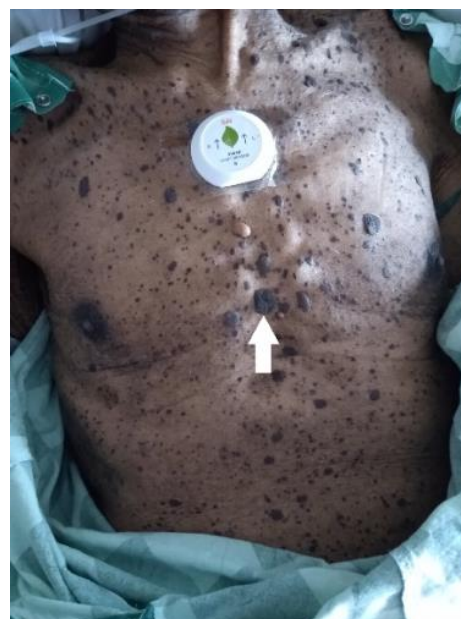
Image 1. Multiple seborrheic keratoses (arrow) on the chest and abdomen.

The patient had no abdominal tenderness to palpation. However, he did have significant lower extremity edema. His constellation of symptoms in combination with the cutaneous finding (absent on skin exams from his admission two months prior) raised suspicion that his eruptive skin lesions were a manifestation of the Leser-Trélat sign (LTS). He underwent computed tomography (CT) of the abdomen and pelvis, which revealed a lobular mass in the pancreatic body measuring 10 centimeters (cm) x 11 cm x 12 cm, concerning for likely malignancy (Images 2, 3). After admission to the hospital, the