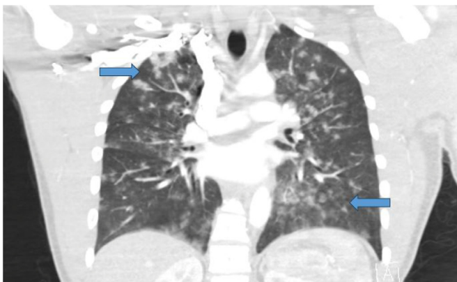
Image 2. Coronal view of computed tomography angiogram of the chest demonstrating diffuse alveolar hemorrhage (arrows).