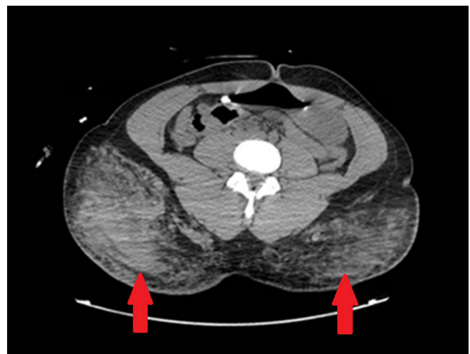
Image 2. Computed tomography of the abdomen and pelvis with contrast demonstrating opacities in gluteal subcutaneous fat, suggestive of inflammation from silicone injections (arrows).

Chest radiograph obtained immediately after intubation demonstrated left-sided, ground-glass opacities. Computed tomography demonstrated extensive bilateral pulmonary airspace disease as well as opacities in the gluteal area suggestive of cosmetic injections, consistent with the physical exam ( Images 1 and 2 ). A subsegmental pulmonary embolism was also present. Broad spectrum antibiotics were initiated due to concern for a surgical site infection, given subcutaneous emphysema also present on CT ( Image 3 ). Blood gas results were notable for a lactic acidosis with a pH of 7.24 (reference range 7.35–7.45). A decreased ratio of arterial oxygen partial pressure to fractional inspired oxygen