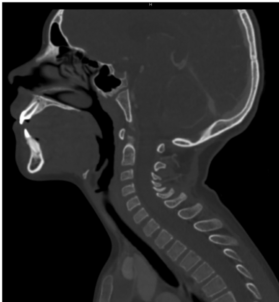
Image 1. Sagittal view of computed tomography soft tissue neck with contrast with evidence of maxillary sinus disease and without evidence of hemorrhage or other infectious etiology for torticollis.

Given that there was no significant improvement, magnetic resonance imaging (MRI) of the cervical spine was obtained and revealed an epidural spinal hemorrhage and a partially visualized left cerebellar hemorrhage. Subsequent imaging included an MRI brain with contrast and a CT angiogram that showed a left cerebellar hemorrhage from a cavernous malformation without evidence of an intracranial mass ( Images 2, 3 ). The patient remained in the intensive care unit for five days, where he transiently developed left facial weakness and left upper extremity dysmetria. He received a course of dexamethasone and pain medications during this time. Pediatric neurosurgery discussed surgical resection options; however, the family deferred in favor of close neurosurgical follow-up. His torticollis and neurological deficits were resolved by the time of discharge on day five of hospitalization.