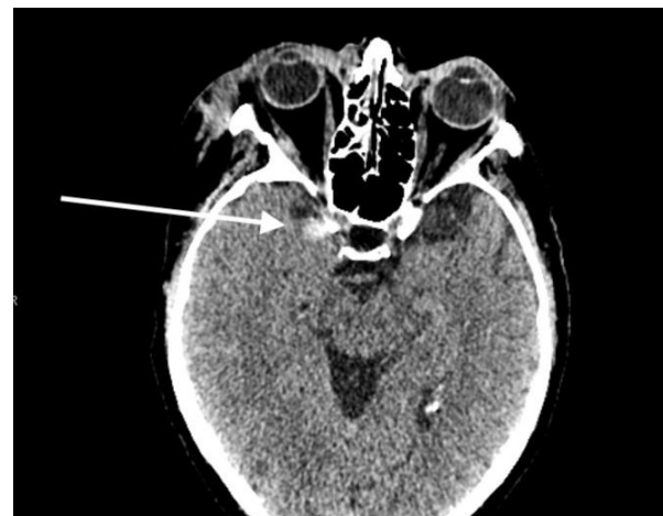
Image 2. Computer tomography of the head demonstrating foci of subarachnoid hemorrhage (arrow).