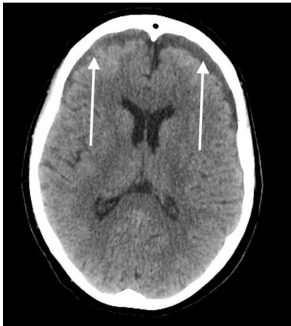
Image 3. Computed tomography of the head demonstrating right and left subdural hematomas (arrows).

six hours. The following day, the patient's repeat CT head without contrast showed new bilateral subdural hematomas measuring eight millimeters (mm) on the frontal aspect on the right and seven mm on the left, and SAH in the left parietal lobe [Image 3].