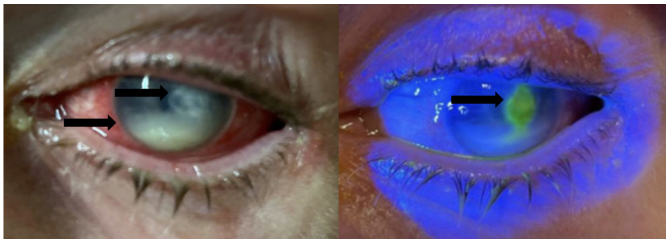
Image 2. Left eye on second emergency department presentation under normal lighting prior to fluorescein staining (left) and under Woods lamp after fluorescein administration (right), demonstrating conjunctival injection, hypopyon, and paracentral corneal ulcer with fluorescein uptake. Top arrow in the left image points to unstained corneal ulcer, while the bottom arrow in the left image points to hypopyon. The arrow in the right image points to fluorescein-stained corneal ulcer.