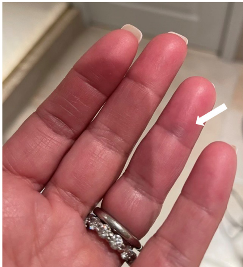
Image 1. A bluish discoloration resembling a circle noted to the volar aspect of the left fourth digit just distal to the crease of the distal phalanx. Of note, the dark discoloration seen in the second, third, and proximal aspect of the fourthth digit are the result of a shadow from the patient's phone.