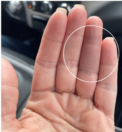
Image 3. A mostly resolved area of ecchymosis seen at the volar aspect of the fourth digit on the left.

numbness of one or more digits. Despite first being reported in 1958, this remains a little-known disease which, on review of current available case reports, often results in unnecessary testing, consultations, and anxiety for patients. The emergent concern in the initial presentation of Achenbach syndrome is acute limb ischemia where thrombosis, embolism, or dissection may lead to sudden arterial occlusion. If this were the case, patients would commonly experience pain, cold skin, pallor, or pulselessness. 4 However, in Achenbach syndrome, pulses and temperature are intact, and patients tend to present with ecchymosis of just the volar aspect of a digit. Reports indicate a propensity for this syndrome to occur on the volar aspect of the third or fourth digits in women but have also been reported to occur in men and on nearly all other digits, the dorsal aspect of digits, the palm, and even toes. 1 In our patient, sparing of the distal phalanx was very prominent; this finding may not be the case in all patients with this syndrome.