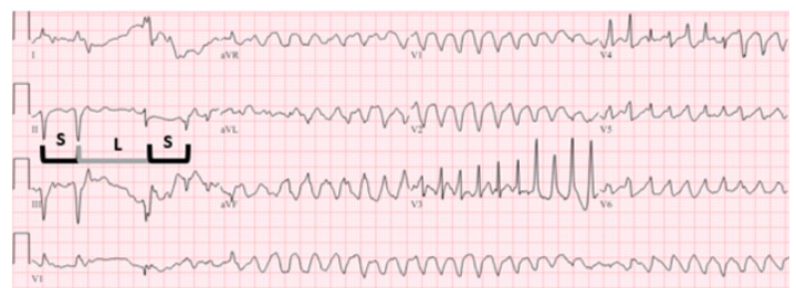
Image 2. 12-lead electrocardiogram (ECG) captured during development of torsades. The ECG displays the classic “short-long-short” sequence prior to development of the dysrhythmia, with “S” representing the short RR interval and “L” representing the long RR interval.

Sharing this case will raise awareness of the risk factors and emergency management of torsades de pointes.