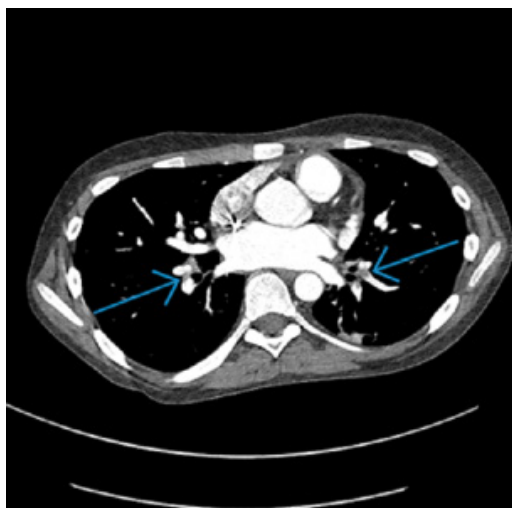
Image 1. Computed tomography pulmonary angiogram demonstrating pulmonary emboli in the right middle lobe and left upper lobe (blue arrows).

Approximately 2½ hours after morphine administration, the patient reported improved pain; however, his oxygen saturation decreased intermittently to 75% and improved to 95% with 1 L per minute of oxygen via nasal cannula. Upon reexamination by a second clinician, the patient's heart rate was noted to have increased to 100 BPM at rest despite improved pain control. A chest radiograph demonstrated mild perihilar interstitial opacities and central pulmonary vascular congestion. Due to continued intermittent desaturations to 75%, tachycardia, and prothrombotic risk factors of ALL and immobility, a computed tomography