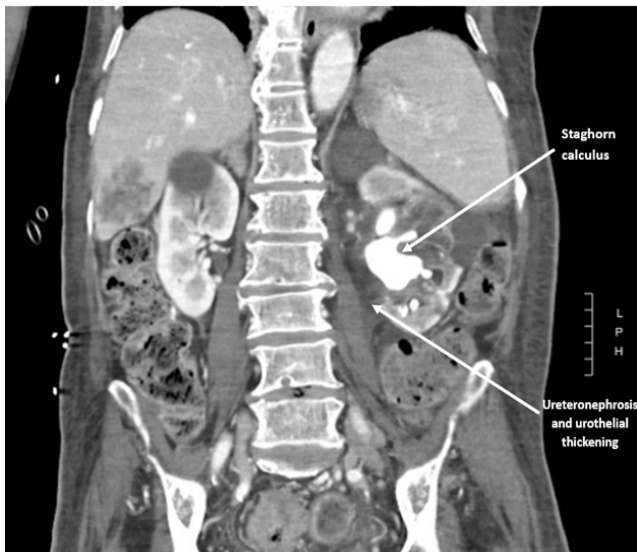
Image 2. Computed tomography coronal view of a large left staghorn calculus with significant hydronephrosis and urothelial thickening.

metastatic colon cancer with intestinal obstruction and contained bowel perforation, invasive therapeutic intervention with endoscopic retrograde cholangiopancreatography and surgical intervention of the cholecystoduodenal fistula and staghorn calculi were deferred. The patient was treated with IV antibiotics for seven days and discharged back to his facility with goals to prioritize comfort and avoid further hospitalizations.