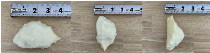
Image 2. Piece of cotton foam (9.5 x 5.1 x 5.1 centimeter) presented to clinical team by patient after being asked about ingestion of non-nutritive substances. The patient stated that she had last ingested cotton foam two days prior to her presentation to the emergency department.