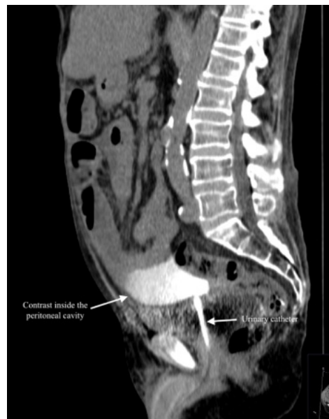
Image 1. Abdominopelvic computer tomography (sagittal plane) displaying extravasation of contrast administered through the urinary catheter into the peritoneal cavity.

A 78-year-old male with alcoholic cirrhosis and chronic renal disease with a longstanding indwelling urinary catheter (UC), previously placed because of obstructive uropathy, was admitted to the hospital due to acute-on-chronic liver failure associated with spontaneous bacterial peritonitis. On the fourth day of hospitalization approximately six liters of a yellow, turbid fluid, consistent with infected ascitic fluid, were unexpectedly drained via the UC through the night. This incident resulted in the patient developing somnolence and mild abdominal discomfort. A physical examination revealed pallor, hypotension (blood pressure of 53/29 millimeters of mercury), and sinus tachycardia (heart rate of 105 beats per minute), suggesting significant hemodynamic instability. Besides neurological and cardiac dysfunctions, acute kidney failure was also documented. The imaging studies, including abdominal ultrasonography and computed tomography, revealed extravasation of contrast material injected through the UC into the peritoneal cavity, indicating bladder perforation and confirming the intraperitoneal placement of the catheter (Images 1 and 2).