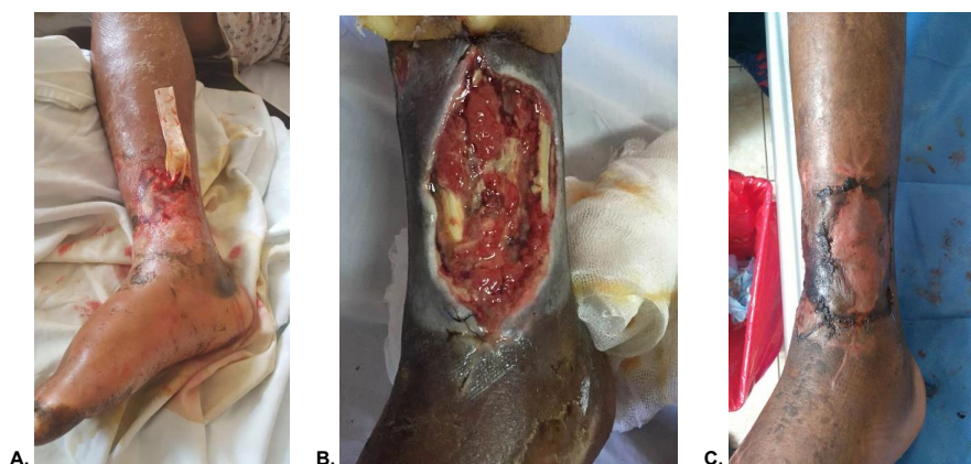
Image 1. Progressive treatment of extensive myonecrosis in snakebite victim. A. 10 days after bite with drain insert into abscess. B. Two weeks after bite and extensive debridement. C. Status post graft hospital day 50.

Our patient was geographically isolated and spent days receiving shamanistic care. These are common barriers for those living in remote rainforest communities that prevent prompt definitive care of snakebites. Approximately half of those bitten in Latin American countries will be treated first