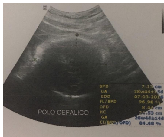
Image 1. Obstetric ultrasound image depicting fetal microcephaly in a mother with a history of Zika virus infection. The fetus is at approximately 34 weeks gestational age with a head circumference of 24.53 cm. The 50th percentile head circumference at 33 weeks and 6 days is around 30 cm. 7

Ultrasound findings in fetuses with congenital Zika virus infection include microcephaly, intracranial calcifications, ventriculomegaly and arthrogryposis, as well as abnormalities of the corpus callosum, cerebrum/cerebellum and eyes (Images 1 and 2). 4,5 Fetal microcephaly is defined as a head circumference measurement either less than two standard deviations below the average head circumference or below the third percentile for sex and gestational age. 6 Microcephaly can be detectable as early as 18-20 weeks gestational age. Diagnostic utility of US increases as gestational age increases. Even in the absence of microcephaly, the presence of intracranial calcifications prior to 22 weeks gestational age may predict its future development. 4 While presence of suspicious findings should prompt urgent referral, regardless of bedside US appearance,