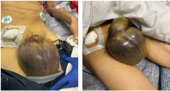
Image 1. Significant swelling and ecchymosis to the scrotum with recent right femoral artery access site. Left side shows initial presentation, while right side shows progression with extension up the penile shaft two hours later.

evaluation, the patient became severely hypotensive with a blood pressure of 58/25 mm Hg, and mass transfusion protocol was initiated. Hemostasis was attempted with a 10-pound sandbag and direct pressure over the access site.