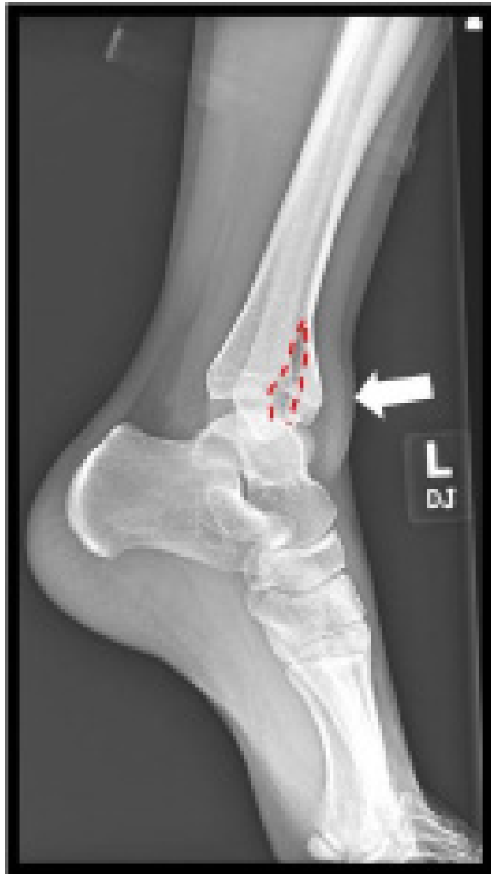
Image 1. Lateral view plain film reveals a vertical fracture of the distal tibia (red dashed line) and soft-tissue swelling (white arrow).

fractures in a differential diagnosis and investigating appropriate management for low-energy, less-complex fracture subtypes, even when the affected patient's demographics do not necessarily match the associated risk factors for this condition.