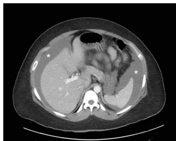
Image 2. Abdominal computed tomography, cross section, demonstrating location of hemoperitoneum (asterisks).