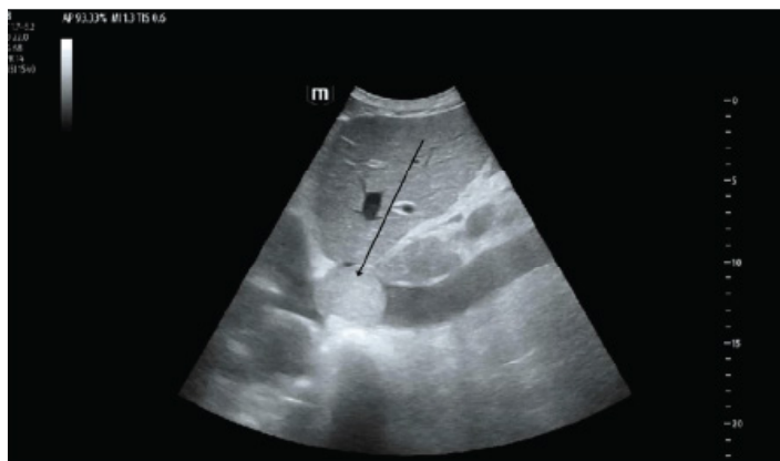
Image 1. Point-of-care ultrasound of the inferior vena cava (IVC) showing a hyperechoic circular mass in the proximal IVC (arrow) adjacent to the right atrium. Distal IVC is seen plethoric.

from congenital malformations, trauma, or acquired diseases that result in compression and hinder venous return. 1,2 Among the risk factors for acquired IVC-related illnesses are