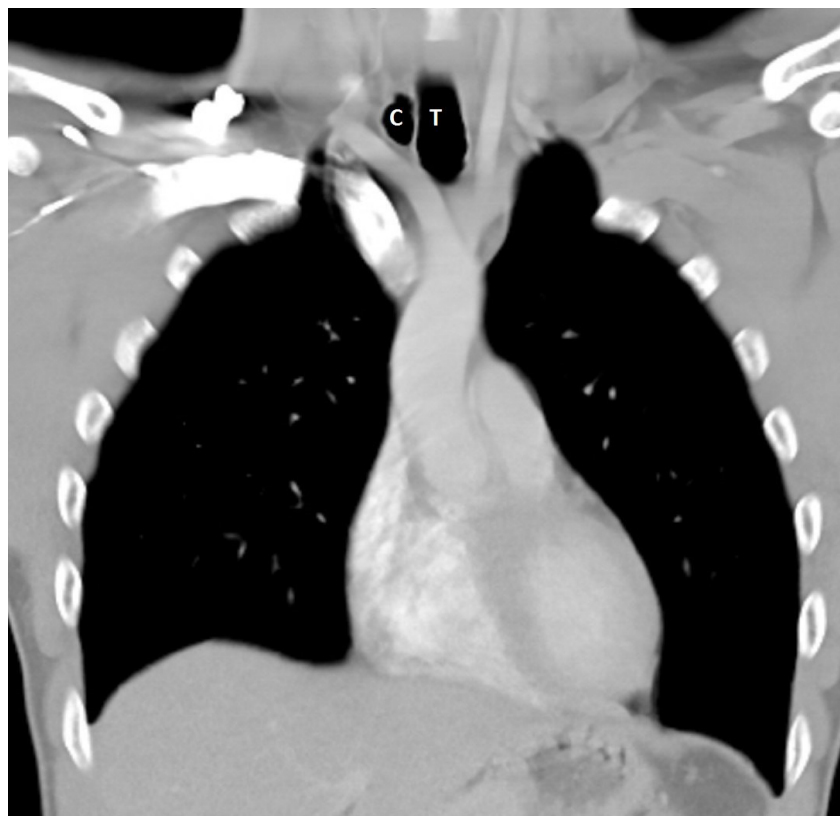
Image 1. Right-sided paratracheal cyst in the thoracic outlet. T, trachea; C, paratracheal cyst.

unremarkable. Due to the patient's history and intoxication, computed tomography (CT) of the head, cervical spine, chest and abdomen were obtained and were unremarkable with the exception of a collection of air on the right side of the upper trachea and anterior to the right lung apex (Image 1). It did not seem to communicate with either the lung or trachea and there was no evidence of lung tissue in the air collection in the lung window images (Image 2). However, the patient had reported trauma to the right chest/abdominal wall. After consulting the