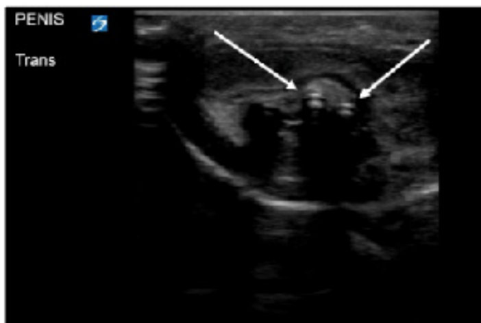
Image 3. Transverse ultrasound view of the penis using a linear probe. A hyperechoic foreign body (white arrows) seen in the urethra, with evidence of looping of the object.

a braided USB-type cord without hub attachments into his urethra. He had similarly inserted foreign bodies into his urethra in the past but stated, “This is the first time I couldn’t get it out.” On arrival the patient was in no acute distress. Genitourinary exam was significant for a single, braided cord protruding from the urethra. Neither the patient nor the emergency physicians were able to extract the cord with gentle traction. Using POCUS, the clinicians identified the cord in the bladder, as well as evidence that the cord had looped within the urethra (Image 3). Urology was consulted, and a urologist evaluated the patient at bedside. The patient