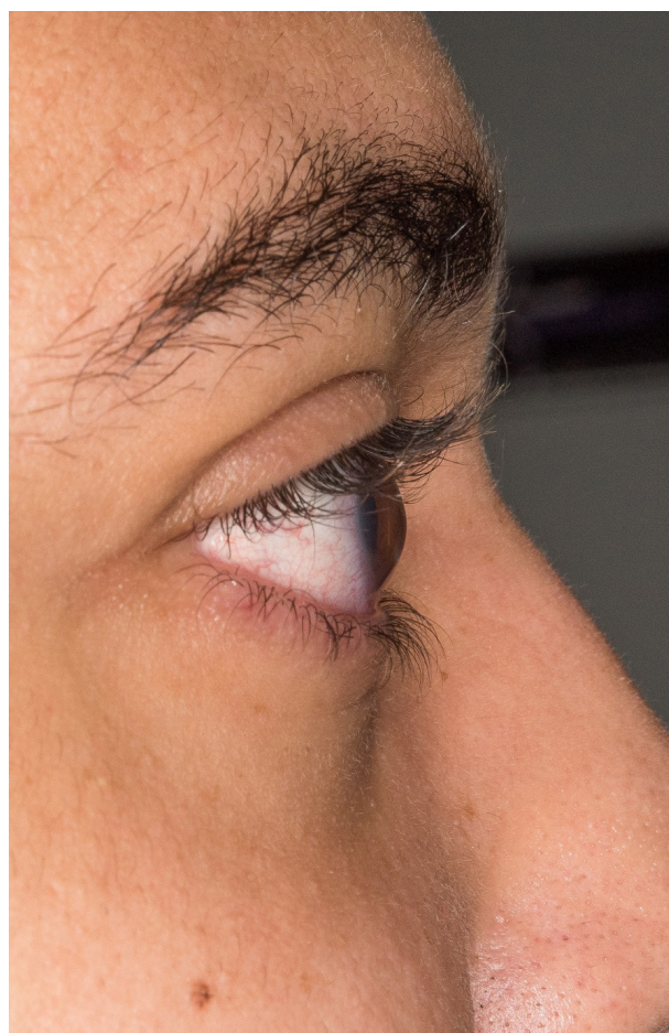
Image 1. Conical appearance of cornea, seen in keratoconus.

The opacification seen along the inferior aspect of the iris (Image 2) is characteristic of corneal hydrops – a collection of aqueous fluid within the cornea through a tear in Descemet's membrane, which leads to gaping of the posterior surface of the cornea. This allows the aqueous fluid to intrude into the cornea, producing an acute edematous response. Unlike corneal ulcerations, which also have an opacified appearance, in hydrops there is no defect in the outer surface of the cornea and therefore will not uptake fluorescein stain. Patients typically present with a rapid decrease in visual acuity, photophobia and pain. Corneal hydrops is a potential complication seen in patients with corneal ectatic disorders such as keratoconus and post-LASIK ectasia. 1,2 Management includes topical hyperosmotic agents to decrease edema;