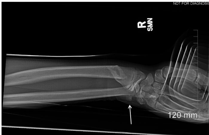
Image 2. Right wrist radiograph, oblique view, of a child with pisiform bone dislocation. Arrow indicates the dislocated pisiform.

pisiform bone. 6,9,10 Missed diagnoses can contribute to difficulty associated with chronic wrist pain, ulnar nerve injury, and post-traumatic arthritis. 11 Recurrent dislocations can result in neurological damage to the ulnar nerve and warrant an emergency reduction; such neurological injury may be avoided through a proper initial assessment. 8