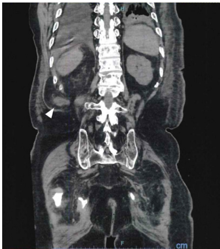
Image 3. Computed tomography (coronal view) showing the herniated ureter through the Petit triangle (arrow).