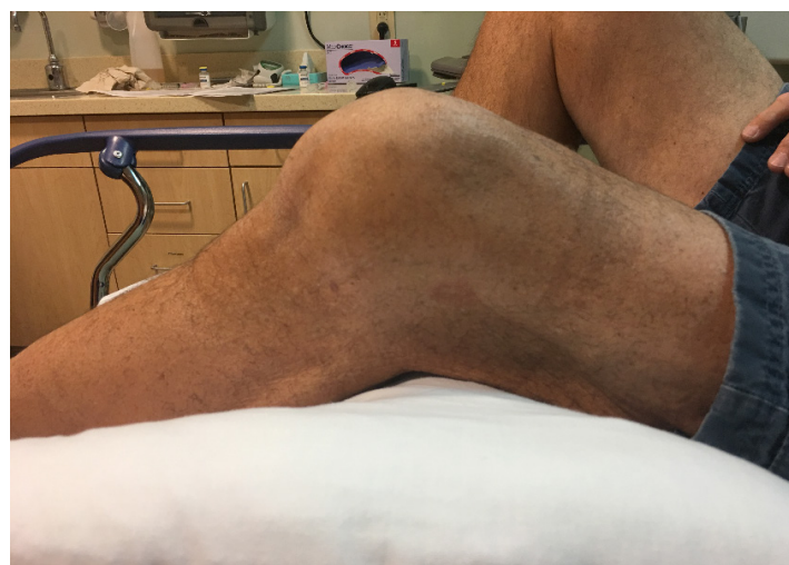
Image 1. Photo of knee showing the position of locked flexion during a cam-jump dislocation of prosthetic knee.

Instability of the knee joint after total knee arthroplasty is a somewhat common complication; however, dislocation is