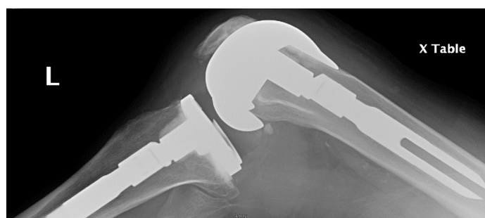
Image 2. Initial lateral radiograph of cam-jump dislocation of prosthetic knee joint. The femoral component is subtly displaced anteriorly versus the tibial component of the prosthesis.

rare and represents the most severe degree of instability. 1 The patient stated that he had “jumped the cam,” which was the term his orthopedist used when he had a similar episode two years previously. With this type of dislocation, hyperflexion of the joint causes the femoral component (“cam”) of the prosthesis to be rotationally translated anteriorly relative to the tibial component (“post”). 2 The posterior aspect of the femoral component becomes locked in articulation with the tibial component and the patient is unable to extend the joint back into a normal position.