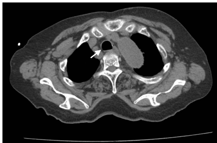
Image 2. Repeated computed tomography with normal trachea (arrow).