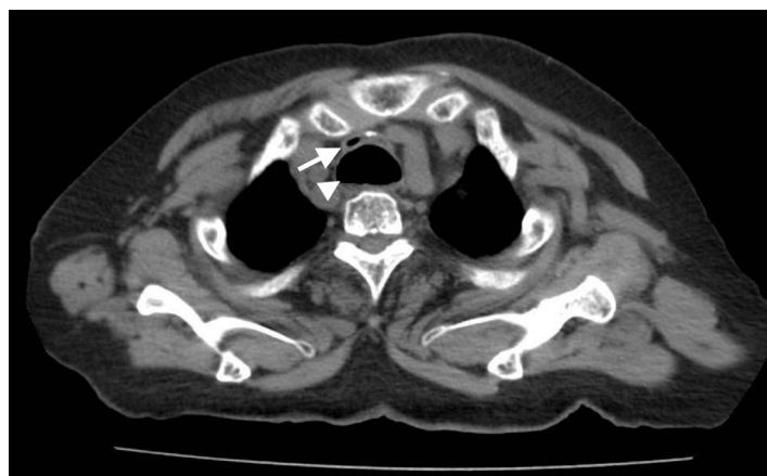
Image 1. Compressed trachea (arrow) by dilated esophagus (arrowhead) at the level of the sternoclavicular joint.

This case presented reversible, severe tracheal compression by dilated esophagus with no functional abnormality. Cases of tracheal compression by dilated esophagus with structural diseases such as hiatal herniation 1 or functional diseases such as esophageal achalasia 2 have been reported. Dyspnea caused by esophageal achalasia is reportedly common in elderly women, who usually recover after treatment for esophageal achalasia. 2 Unfortunately, functional evaluation of the esophagus is not performed in all cases. Some cases improve without treatment. 3 Results obtained in this case suggest that a functionally normal esophagus can sometimes become sufficiently dilated to compress the upper airway, causing severe dyspnea. Spontaneous esophageal dilation is a rare cause of tracheal obstruction, but it is worth considering when no other cause is evident.