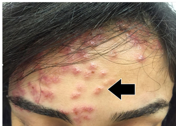
Image 1. Papulovesicular eruptions with petechiae on the forehead of the patient (arrow).

On closer examination of the patient's skin, her rash appeared to have three different morphologies. The first was located on her forehead and consisted of sub-centimeter papulovesicular eruptions with petechiae that were pruritic but not tender (Image 1). The second rash consisted of scattered hemorrhagic vesicles with purpuric macules and was located on her distal upper and lower extremities (Image 2). The third rash was an erythematous and indurated plaque at the base of the left foot, which was tender and made it painful for her to walk.