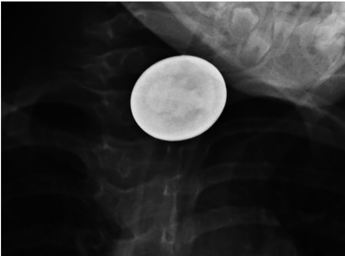
Image 2. Plain radiograph of the chest, windowed to increase contrast. The visible face of George Washington identifies this object as a quarter rather than a button battery.