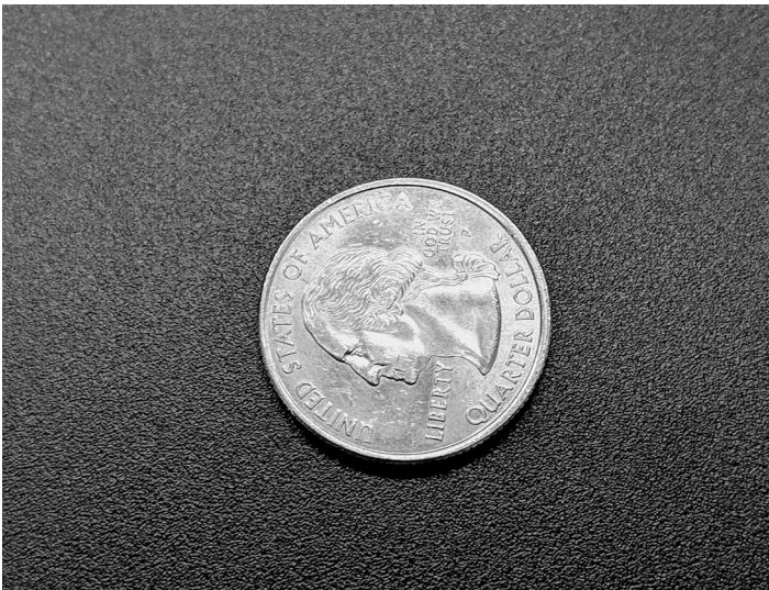
Image 3. Photograph of a quarter, in a similar orientation to the quarter in Image 2.

patients of this age and size. While somewhat reducing subject contrast, this window allowed the beam to better penetrate metal and therefore enhanced the clarity of the quarter while delivering a lower radiation dose to the patient. 4