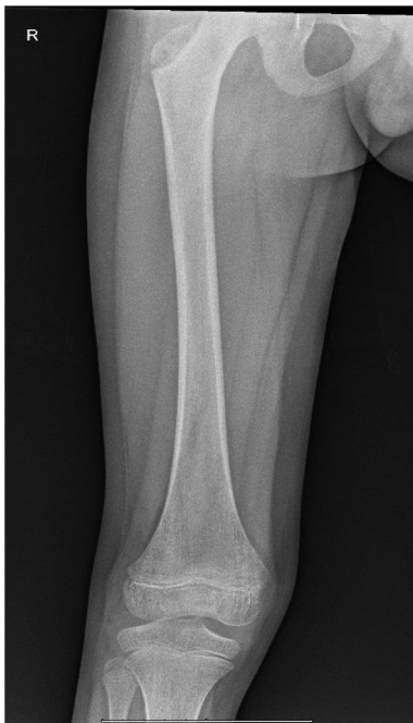
Image 1. Radiograph of the right femur upon emergency department presentation with no acute abnormalities.

The patient was admitted for further evaluation and found to have continued intermittent fevers and right lower extremity pain. On Day 17, he had magnetic resonance imaging (MRI) of the right lower extremity with and without contrast, which revealed right femoral osteomyelitis with underlying intraosseous abscess ( Image 2 ). He was taken to the operating room for a right femur reaming and irrigation with debridement. Blood and tissue cultures grew methicillin susceptible S aureus , and workup was notable for an echocardiogram without evidence of vegetation and abdominal ultrasound without evidence of an intra-abdominal source of infection. He received intravenous