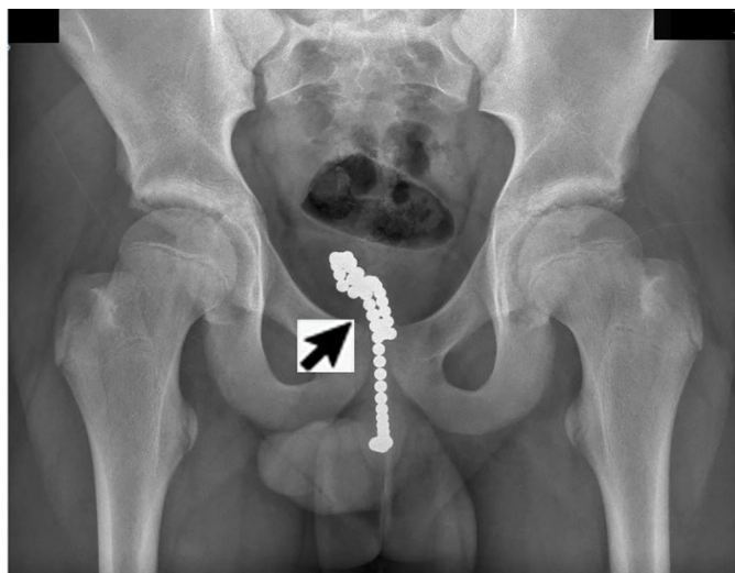
Image 1. An anterior posterior plain film radiograph of the pelvis showing magnetic ball bearings in bladder and urethra.

Polyembolokoilamania, or insertion of an object into a bodily orifice for sexual gratification, is the most common