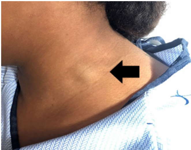
Image 1. Two-centimeter left external jugular pseudoaneurysm as seen on physical exam.

no signs that the pseudoaneurysm was expanding, causing airway compromise, had active extravasation, or was causing emergent neurological involvement at that time. We agreed she was safe for discharge at that time and could follow up with vascular surgery as an outpatient.