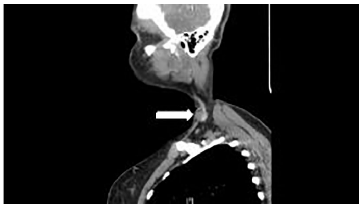
Image 3. Computed tomography with contrast sagittal view of left external jugular venous pseudoaneurysm (arrow).

Venous aneurysms are classified as primary (congenital) and secondary (acquired). 2,5,8 Causes of primary venous aneurysms are not fully understood, 9,13 while possible etiologies for secondary aneurysms within the venous system include thoracic outlet obstruction, trauma, chronic inflammation, degeneration, and increased venous pressure. 2,4,5,11,14 Known risk factors for secondary venous aneurysms include recent trauma, cardiovascular disease, and age. 3