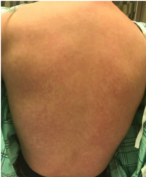
Image 2. Image of the posterior trunk similarly demonstrates a diffuse, maculopapular morbilliform rash.