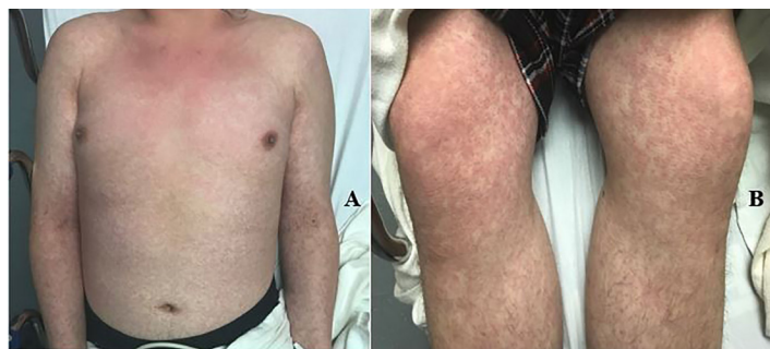
Image 1. Image of the anterior trunk and upper extremities (A) and anterior lower extremities (B) demonstrating a diffuse, morbilliform, maculopapular rash.

A 20-year-old previously healthy male originally presented to an urgent care center with a chief complaint of fever and rash. He was diagnosed with a viral upper respiratory infection and sent home with supportive care. Six days later, the patient presented to the emergency department (ED) with continued fever and rash. Vital signs included a temperature of 103.0° Fahrenheit, heart rate 115 beats per minute, blood pressure 93/54 millimeters of mercury, respiratory rate 24 breaths per minute, and an oxygen saturation of 91%. Physical examination revealed a diffuse, morbilliform rash across the trunk and extremities, sparing the face (Images 1 and 2). There was no mucosal or ocular involvement. Chest radiograph revealed bilateral infiltrates consistent with multifocal pneumonia (Image 3). Labs included a normal leukocyte count (8300 units per liter [uL], reference range 4200-9100/uL) with an absolute lymphocyte count of 800/uL (reference range 1300-3600/uL). A C-reactive protein was elevated at 118.5 milligrams per liter (mg/L) (reference range 0-5 mg/L). A rapid strep test and an human immunodeficiency virus test were both negative, as was a respiratory viral panel. The patient required escalating