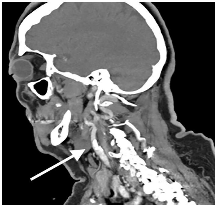
Image 1. Sagittal view of computed tomography with angiography of the head and neck identifying an intimal flap in the left internal carotid artery consistent with a carotid artery dissection.

The differential diagnosis included acute myocardial infarction, trigeminal neuralgia, temporal arteritis, temporomandibular joint dysfunction, herpes zoster, subarachnoid hemorrhage, dentalgia, and other causes of acute jaw pain in an elderly female patient. CTA of the head and facial bones without intravenous (IV) contrast were grossly normal. Electrocardiogram revealed rate-controlled atrial fibrillation without acute ischemic changes. Chest radiograph was clear. Laboratory analysis revealed an erythrocyte sedimentation rate of 34 millimeters per hour (mm/hr) (reference range 0-30 mm/hr); the remainder of the