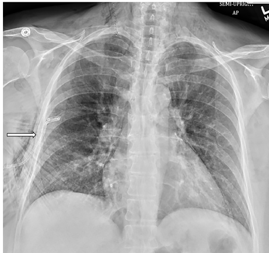
Image 3. Successful lung re-expansion after right-sided pigtail catheter (arrow) was placed using a more anterior approach. Note improved mediastinal shift.

the most common complication reported being chest tube leak. 4,5 The vast majority of reported cases presented with either face, neck, or chest subcutaneous air on exam or imaging, 3-8 and only one episode of hypotension from tension pneumothorax was reported. 3