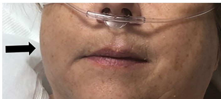
Image 1. Right-sided facial swelling and crepitus noted several hours postoperatively. Patient also reported voice change and dyspnea. Facial swelling denoted by arrow.

Only a handful of case reports and case series describe an association between arthroscopic shoulder surgery and postoperative pneumothorax 3-8 ; however, cases may be under-reported. It has been postulated that these may be related to preoperative regional anesthesia (notably the interscalene brachial plexus block), 5,6,8 intubation and related airway trauma, 3,9 as well as injury to the parietal pleura from laparoscopy including continuous positive pressure-driven pump infusion in the joint space or intra-articular shaving. 3,7 Patient positioning, including the beach chair vs lateral decubitus, has also been posited as an increased risk for pneumothorax. 7 Of the cases reported, the majority had underlying lung disease (chronic obstructive