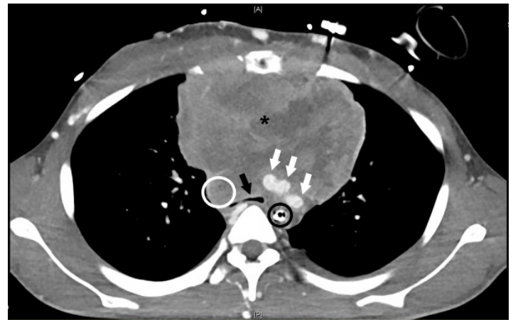
Image 2. Axial computed tomography with contrast image of the chest. Contrast within the vessels appears white. A heterogeneously enhancing mass is seen occupying the anterior mediastinum (asterisk). There is significant compression of the trachea (black arrow) at the level of the carina, which is smaller in diameter than the adjacent orogastric tube (black circle). White arrows indicate brachiocephalic, left carotid, and left subclavian vessels just superior to their origins from the aortic arch. The superior vena cava (which should be in the vicinity of the white circle) is conspicuously absent.

by endotracheal intubation, he remained difficult to ventilate due to lower airway compression. Mediastinal mass syndrome can lead to arrest due to compression or obstruction of critical structures, including airway obstruction, as in our patient. Circulatory obstruction leading to obstructive shock is possible due to massive PE, pericardial effusion causing tamponade physiology, direct compression of the heart by the mass, and positional SVC syndrome causing sudden decrease in cardiac venous return. 4 Recognizing central obstruction will allow providers to appropriately manage abnormal respiratory and circulatory physiology.