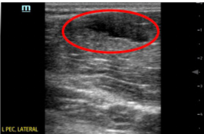
Image 4. Point-of-care ultrasound image displaying hypoechoic hematoma formation (red circle) in the distal portion of pectoralis major muscle bellies.

The pectoralis major is a complex, fan-shaped muscle comprised of a clavicular head, originating from the medial half of the clavicle, and a sternocostal head, originating from the anterior sternum, costal cartilages of ribs 1-7, and the aponeurosis of the external oblique. 10 The two heads coalesce into a common tendon and insert into the lateral lip of the intertubercular sulcus of the humerus. 10 Rupture occurs most commonly in patients with a history of weightlifting, causing disruption of the distal humeral entheses. 1-3 Pectoralis major rupture in this patient was strongly suggested by the clinical presentation, but the availability of POCUS to confirm our suspicion assisted in expediting the disposition. Young patients with a history of anabolic steroid use should also be evaluated for tendinous disruption due to decreased tensile strength of the tendons secondary to steroid-induced dysplasia of the collagen fibrils. 11