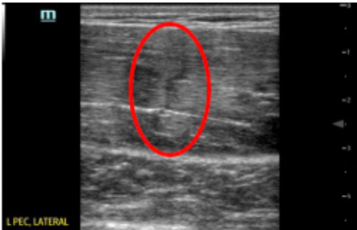
Image 3. Point-of-care ultrasound image displaying disruption of the distal pectoralis major muscle bellies with vertical interruption noted (red circle).