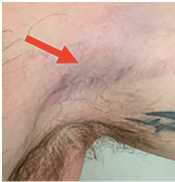
Image 1. Bedside photograph displaying prominent ecchymoses (red arrow) over patient's left axilla.

bruising in the axilla (Image 1). There was asymmetric loss of normal contour of the left pectoralis major, and the left nipple was noted to be lower than the right (Image 2). Tenderness to palpation was reported across the left pectoral region, left axilla, and left anterior deltoid. Additionally, there was decreased strength with arm adduction and increased pain with internal rotation at the shoulder. Given the convincing clinical history and physical exam for pectoralis major rupture, POCUS was used for further evaluation. On sonography there were hypoechoic disruptions of muscular striations, hematoma formation, and pectoralis major muscle retraction noted at the site of injury, helping to confirm the pectoralis major rupture (Images 3 and 4). Radiographs of the left shoulder were performed showing no osseous injury. The orthopedic surgery team was consulted and scheduled the patient for magnetic resonance imaging (MRI) and prompt outpatient follow-up with a shoulder subspecialist.