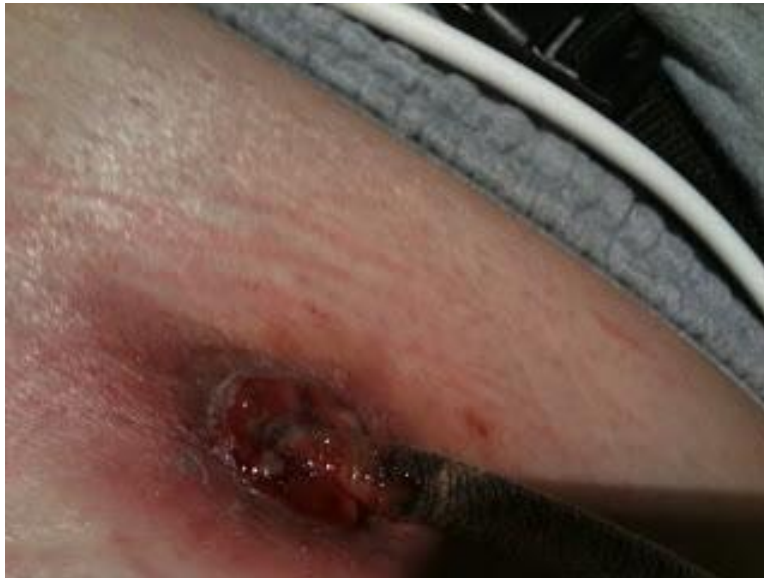
Image courtesy: http://lvad-inc.blogspot.com/2012/01/human-body-and-its-miracle-of-healing.html