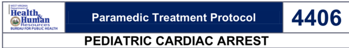
Figure 1. West Virginia Office of Emergency Medical Services algorithm for resuscitation of pediatric asystolic arrest.