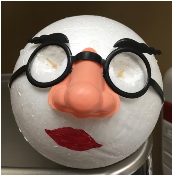
Figure 1. Model before insertion of grapes: Author's own image.