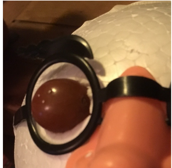
Figure 2. Metallic foreign bodies in place