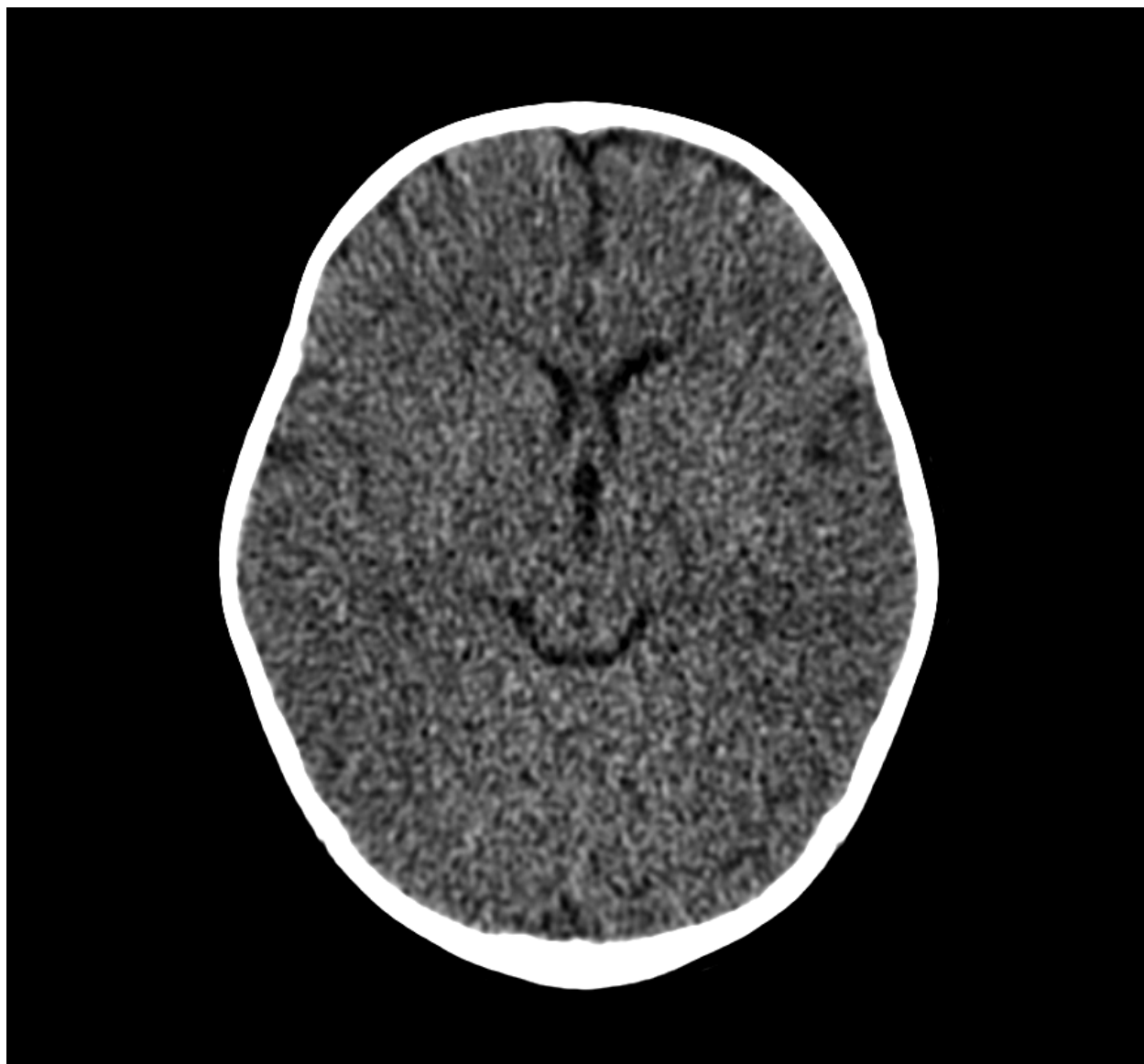
Image Source: Herman L. Normal pediatric CT head. Own work. 2022. Used with permission.