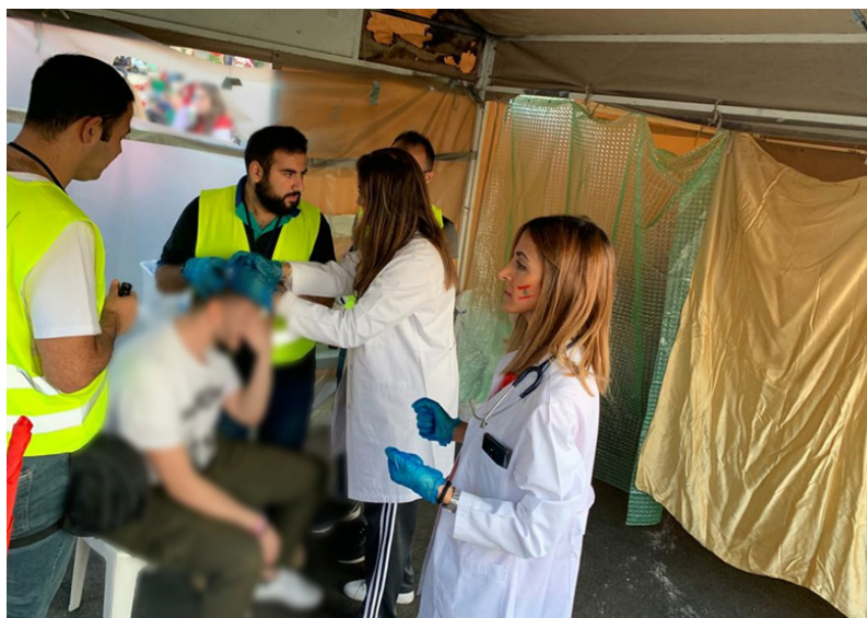
Figure 3 Physician-led first aid within the tent

Storage of the medical equipment and supplies at night, when the streets were deserted, was a significant undertaking. As the tent was operated by volunteers who were unable to guard the location around the clock, the equipment and supplies were not properly secured. Therefore, team members stored the supplies in their own vehicles. This