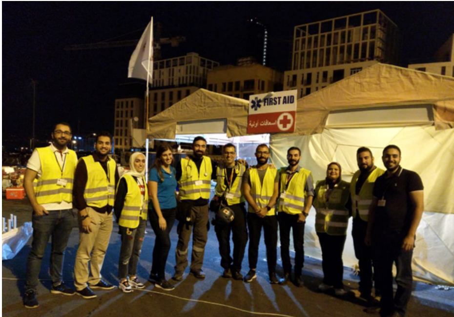
Figure 2 First aid tent with some of the volunteers.

staffing proved challenging and hindered the ability to provide the service on several occasions despite the need created by a flare-up in the protests.