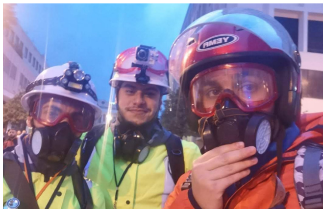
Figure 5 Each volunteer of the roaming team was equipped with a respirator, eye protection and a helmet.

be standard practice was stymied by two realities. First, SVs found it difficult to witness a person being injured nearby and not intervene while waiting for the area to regain calm. Second, the roaming teams would occasionally find themselves caught in no-man's land between the protesters, the agitators and riot police. A "safe area" could suddenly and unexpectedly become a hot zone as the lines shifted abruptly. First aid providers were inevitably injured from being directly targeted by agitators or getting "caught in the crossfire". The affected members were either attacked directly, hit by "less-lethal" munitions including rubber bullets and tear gas or struck by thrown rocks and other projectiles.