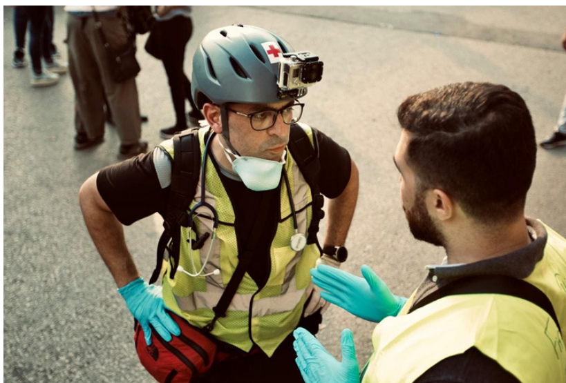
Figure 4 Before adequate donations and Pre-COVID19: limited funds meant limited protective gear. An emergency physician pictured here wearing a ski-helmet

Prehospital providers are traditionally trained to establish scene safety as a priority before engaging with patients. This proved problematic in the volatile and unpredictable environment during protests. 26 Roaming teams were instructed to stand off to the periphery in the warm or cold zone and wait for injuries to be brought to them, or approach once the area has regained calm. What appeared to