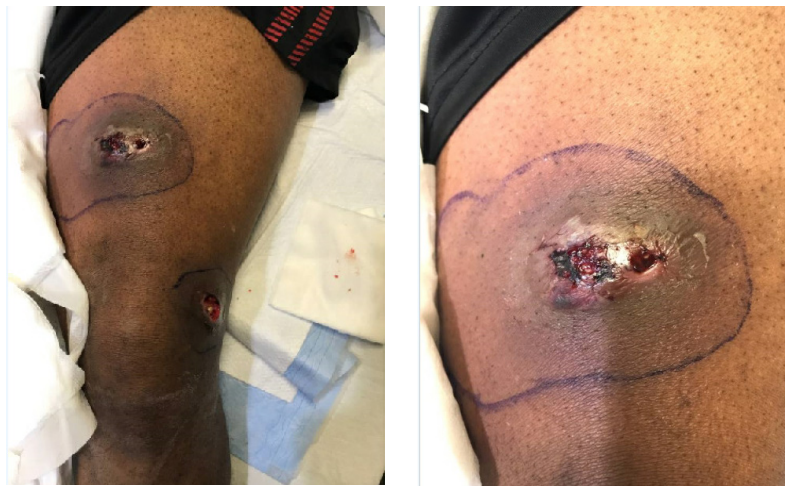
Figure 1 Patient's wounds

tender hyperpigmented ulcerations to the anterior and medial aspect of the left thigh (Figure 1). The rest of his physical examination was unremarkable. Computed tomography imaging of the left thigh and knee were obtained in the ED, and interpreted as “areas of focal cellulitis at the anteromedial aspect of the distal thigh and anterolateral aspect of the