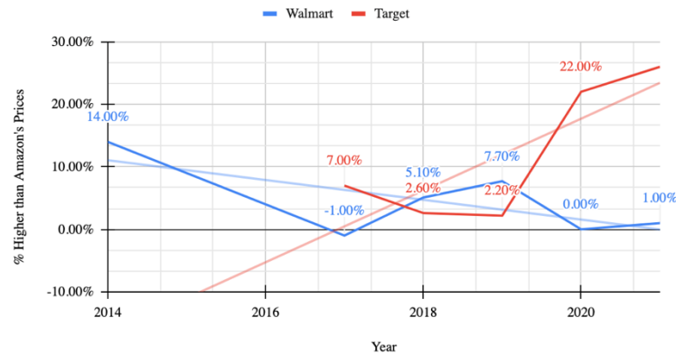
Graph 3: Price Differentials with Amazon in Beauty Products

Profitero's price data suggests brick-and-mortar retailers like Walmart and Target have, to varying degrees, competed with Amazon on prices at different points in the last decade. Based on this limited data, two trends appear: (1) the price differential trendline for Walmart relative to Amazon (indicated by the light blue lines in the graphs) has decreased since 2014 and (2) the price differential trendline for Target (indicated by the light red lines in the graphs) has increased over time. While the continuing existence of a price gap between Walmart/Target and Amazon may suggest there has been no price disciplining, the fact that the gap between some retailers and Amazon has been decreasing (in some product categories more than others) suggests that there has been some effect on prices. Assuming Amazon has not been raising its prices, the decreasing price differentials between retailers like Walmart and Amazon throughout the years suggest that Walmart has been responsive to Amazon's prices.