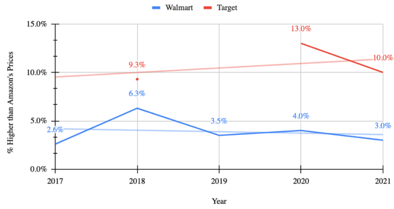
Graph 2: Price Differentials with Amazon in Household Products