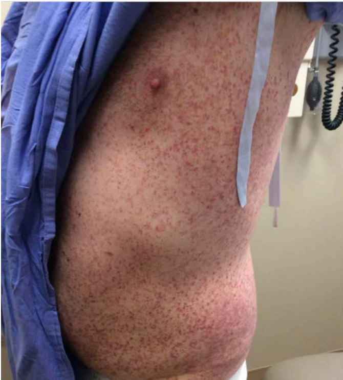
Figure 1: Trunk showing red macular lesions.