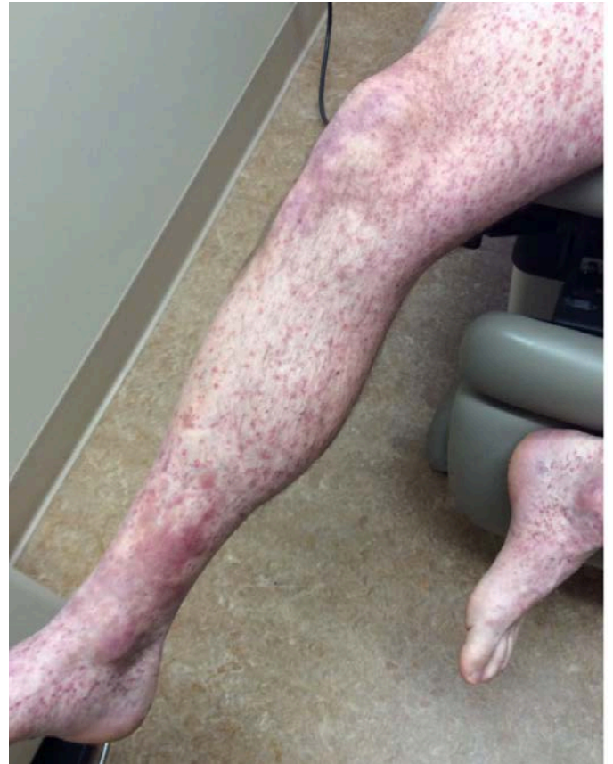
Figure 3: Right lower extremity showing purpura and red macular lesions.