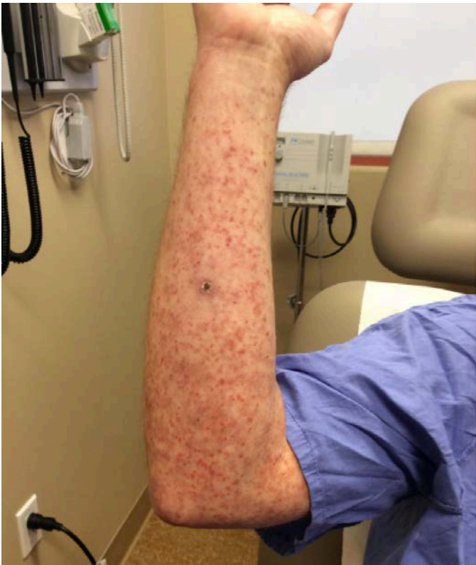
Figure 2: Right upper extremity showing red macular lesions.