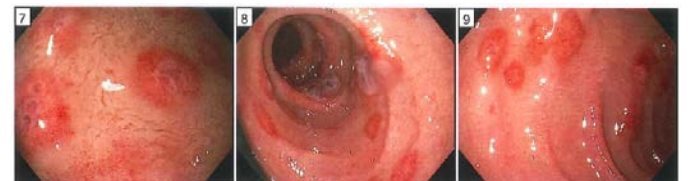
Figure 4: Esophagoduodenoscopy (EGD) showing erythematous nodules and superficial erosions in the duodenum.