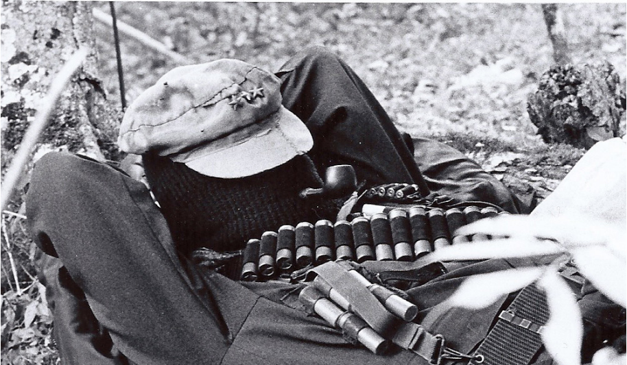
SubCommandante Marcos, March 1994, Chiapas, Mexico.

most obviously we depart from traditional legal discourse, certainly from traditional legal scholarship, and use narrative to analyze law in order to provide the person the ability to analyze their common everyday lived reality from a critically conscious lens.