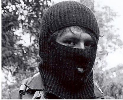
Major Marcos, Chiapas, Mexico, March 1994.

modern political sense. We see that masks accomplish several things. They can be transformative, they can be representations of another symbolically significant identity, they can obscure identities to protect one's own identity, and they can challenge and they can critique power. Finally they can give face to previous invisibility.