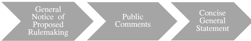
Figure 1: The Notice and Comment Process

Though the notice and comment rulemaking procedures are the default procedures (when the agency’s organic statute is silent regarding additional procedural requirements), the APA acknowledges a few subject matter exceptions to the notice and comment requirements. In particular, the APA states that Section 553 rulemaking requirements are inapplicable if the promulgated rule organizes military or foreign affairs or is a matter relating to “public property, loans, grants, benefits, or contracts.” 54 Hence, if a rule is issued under one of these exempted areas, the rule would have the force of law absent PC. 55 Furthermore, unless the agency’s statute requires a notice or hearing, the notice and comment requirements do not apply “to interpretive rules, general statements of policy, or rules of agency organization, procedure, or practice;” or when the agency for a “good