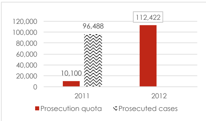
Figure 2: Prosecution quota

In 2012, the AGO revised its plan, setting 112,422 cases to be heard in District Court. 25 However, the total budget did not dramatically change. Therefore, the allocated budget to prosecute each case fell from Rp. 29.5 million ($3,000) per case in 2011 to Rp. 5.8 million ($600) per case in 2012. 26 In 2013, the budget reduced again to Rp. 3.3 million ($330)