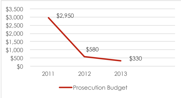
Figure 3: Prosecution budget for criminal cases in Indonesian Attorney General Office

To deal with this problem of backlogs and heavy case loads, law enforcement has begun to evade criminal procedure by creating a “latent regulation” or a “hidden system,” 29 which rushes defendants through indictment, trial, and sentencing, skipping steps along the way and violating criminal procedure law. 30 Under this system, for example, a thievery case under the “ordinary trial procedure” 31 might only proceed for 10 minutes from indictment to verdict. 32 These cases are rushed through the process