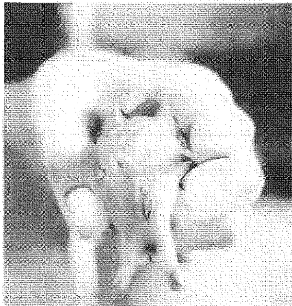
FIGURE 1. Procedure used to hold an Aplysia while recording head pattern.