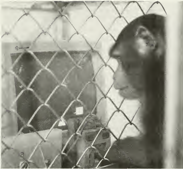
FIGURE 1. Test configuration used with the rhesus monkeys in these experiments. The monkey reaches through the cage mesh and manipulates a joystick to respond to computer-generated stimuli on the screen. A LASER trial can be seen on the screen.

AST 386-SX computers were used. These computers controlled the delivery of 97-mg fruit-flavored pellets (P. J. Noyes Co., Lancaster, NH) through a Gerbrands 5110 dispenser (Gerbrands Corp., Arlington, MA), and of sound feedback through a speaker/amplifier (Radio Shack 32-2031a). Stimuli were presented on a color monitor, to which the monkeys responded by manipulating a standard analog joystick in accordance with task demands. Figure 1 depicts this testing configuration.