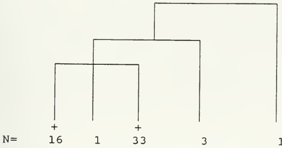
Figure 1. The results of the cluster analysis. Simplified dendrogram presents revealed clusters of rats. Branches marked with "+" symbol illustrate clusters included in further analysis. Numbers illustrate cluster membership.