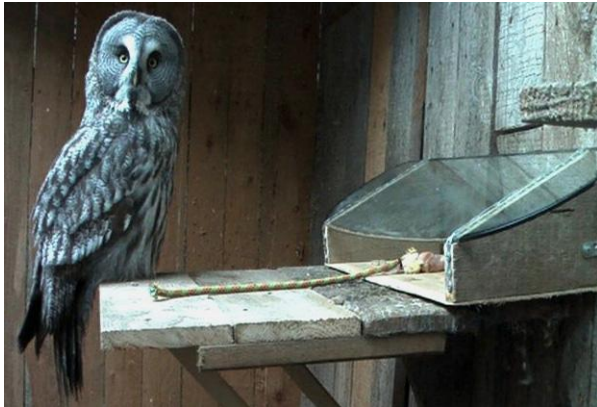
Figure 1. An experimental box.

Owls were tested in a large group aviary (6x6x6 m) and individual aviaries (6x6x3 m). Each aviary was equipped with a perch. An experimental box consisted of three nontransparent sides and a slanting glass as a top. This box was attached to the aviary wall 1.3 m above the floor (Figure 1).